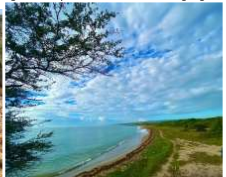
Beautiful view of Old Hellshire Beach from the main road.