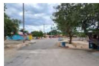
Paved area at Hellshire Beach (Half Moon Bay Fisherman's Cooperative)