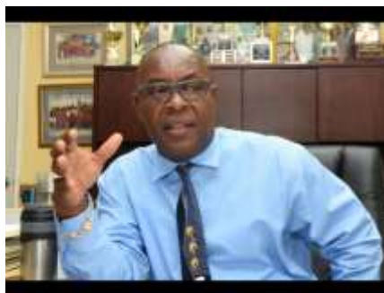
Portmore Mayor, Leon Thomas says residents were consulted and strongly supported the move to have a directly elected Mayor for the Municipality.