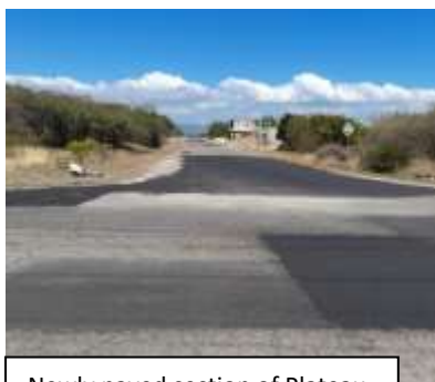
Newly paved section of Plateau Road, off Johnson Hill Main