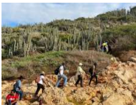
The hike went through the Hellshire Hills to the Old Pier & Ruins.