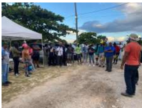
Trekkers get ready for an adventurous hike.

Trekkers enjoyed inspiring and beautiful views of Port Royal, Kingston Harbour, Kingston City and other interesting sights.